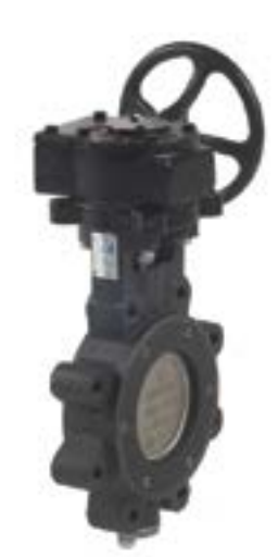
HPILCS WITH GEAR OPERATOR