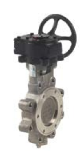
HPILSS WITH GEAR OPERATOR