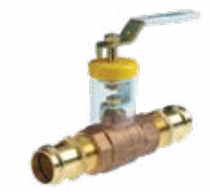
UPBA-100 P2 XH