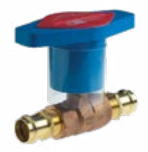
UPBA-400 P2 TIH