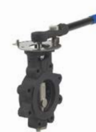
HPILCS WITH LEVER HANDLE

Cast Iron Body, Lug Style, Aluminum Bronze Disc, EPDM Liner, Bi-Directional Dead-End Service 200 psig Max 2" thru 12", Uni-Directional Dead-End Service 150 psig Max, 14" thru 24", IAPMO Tested and certified against NSF/ANSI 372 for "Lead-free" compliance.