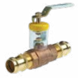
UPBA-400 P2 XH

200 psig @ 250°F, MSS SP-110, Press X Hose-End 1/2" and 3/4"