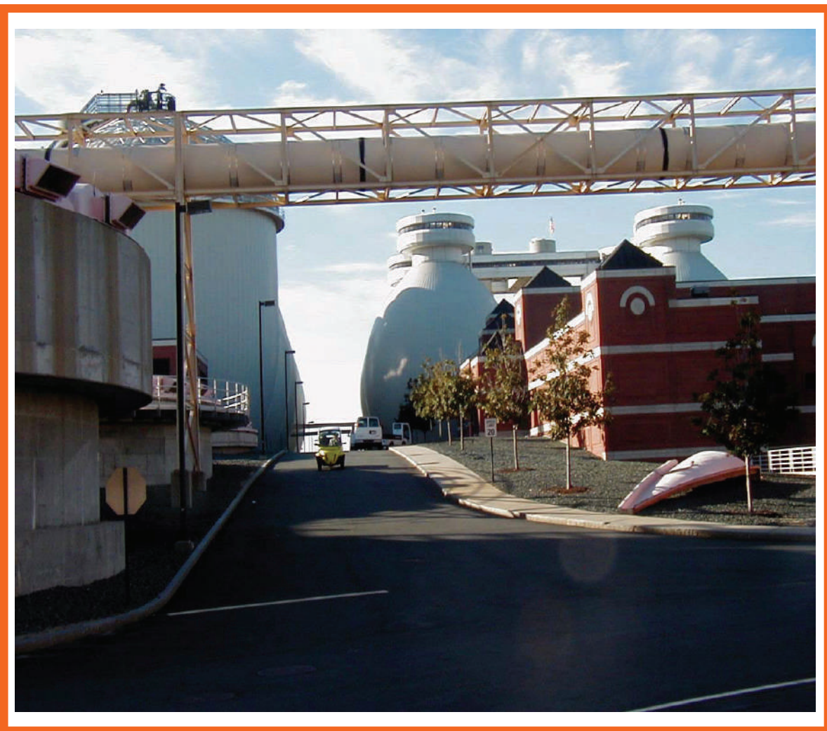
DEER ISLAND WWTP, MA-USA